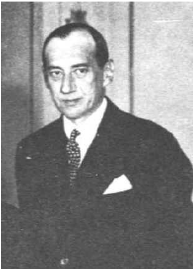
Foreign Minister 1932 - 1939. Escaped to Romania in 1939.