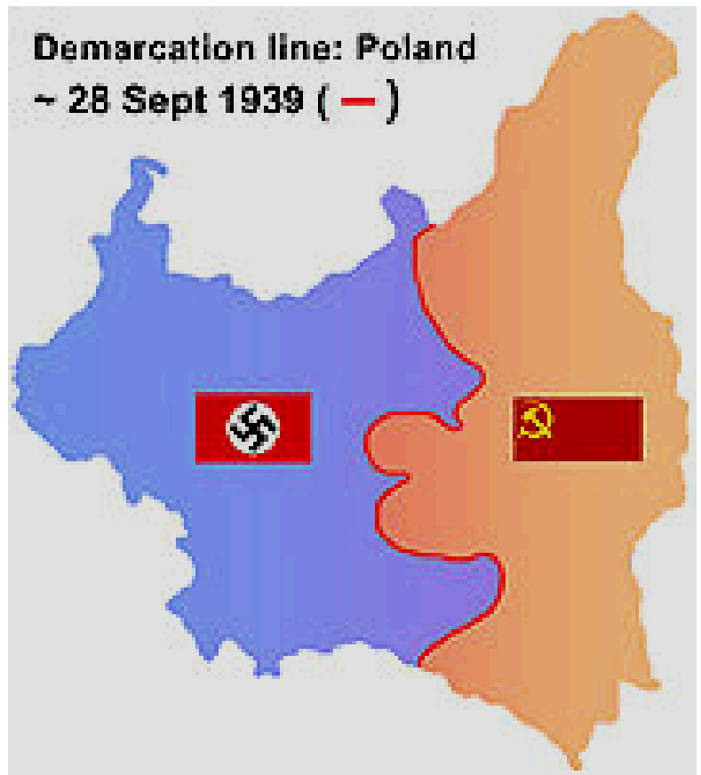
NAZI Germany And Soviet Union Invaded Poland