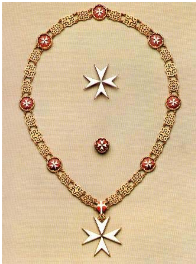
The Insignia of the Prince and Grand Master