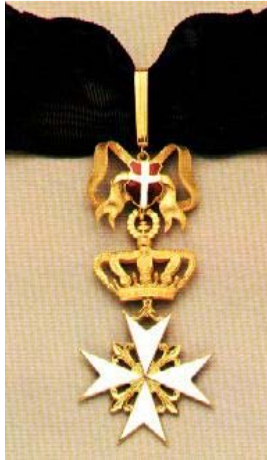
INSIGNIA OF A KNIGHT OF MAGISTRAL GRACE