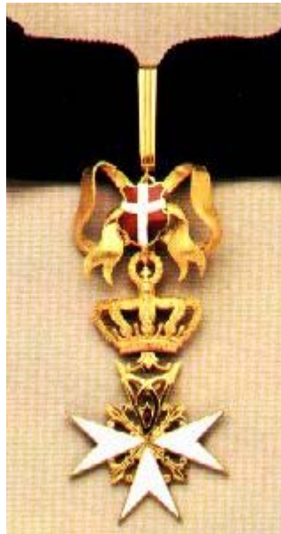
INSIGNIA OF A DONAT OF DEVOTION

In 1997 the changes to the Code and Charter of the Order allowed women to be received into the class of Donat of Devotion. The same changes eliminated the two lower levels of the class of Donat.