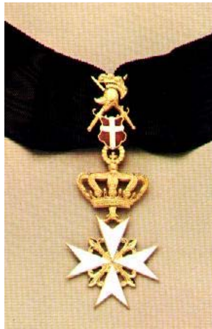
INSIGNIA OF A KNIGHT OF GRACE AND DEVOTION