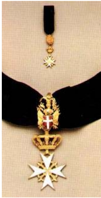
INSIGNIA OF A KNIGHT OF HONOUR AND DEVOTION