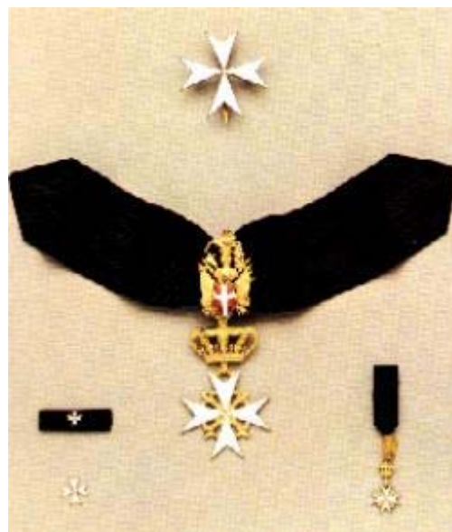
INSIGNIA OF A KNIGHT OF JUSTICE