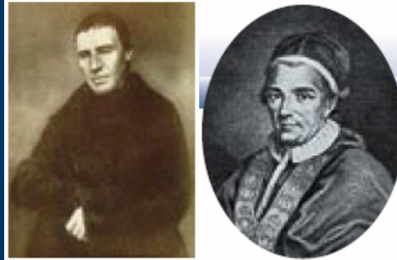
Father General Roothaan

Monte Cristo is no other than the Jesuit Father General. You will now see a very rare picture (painting) of the Jesuit Father General John Roothaan and also the Jesuits enemy Pope Clement XIV.